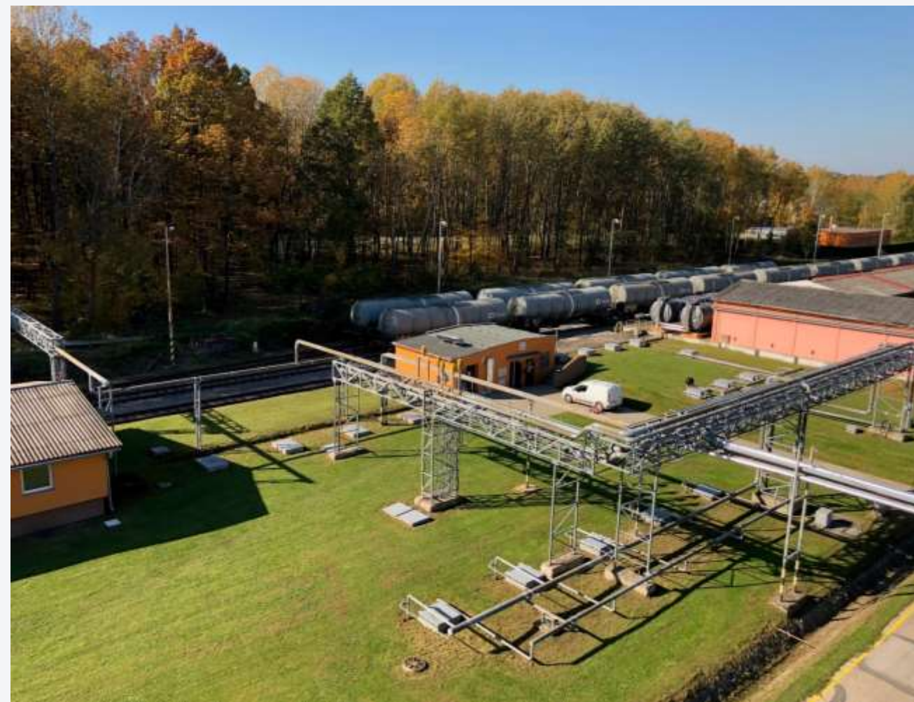
Pipeline, unloading bay and flexible storage